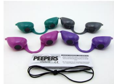
GE0009 – Peepers Modern – Grey, Purple, Pink & Turquoise

We, Australian Gold, LLC, declare under our sole responsibility that the above named products are in conformity with the following Regulations: