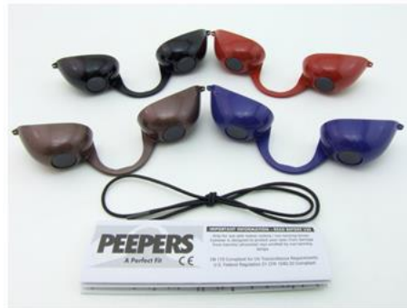
GE0001 – Peepers – Black, Bronze, Blue & Red

Product Description: GE0001 Peepers & GE0009 Peepers Modern, Category II PPE, Protective Eyewear for Tanning with Indoor Sun Lamps